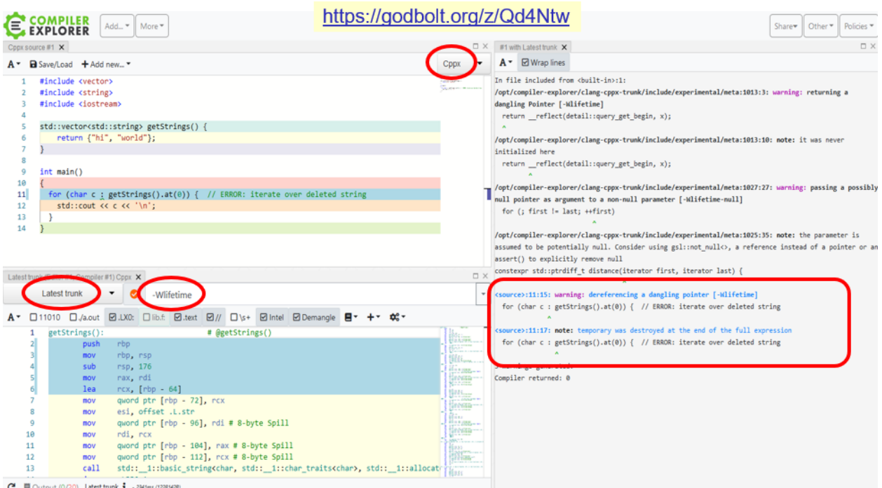
C Output (0/20) Latest trunk : - 2341ms (122

In fact, the first two examples get useful diagnoses with this extension. You get messages like the following: