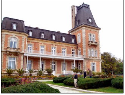
Front Beach Alley, Golden Sands Resort, Varna 9007, Bulgaria